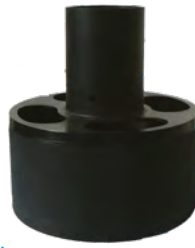
Flow reducer to prevent sedimentation turbulence in the tank