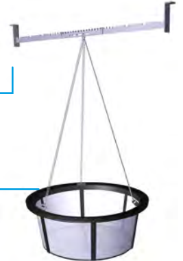
Filter basket with fine screen for suspension in the shaft